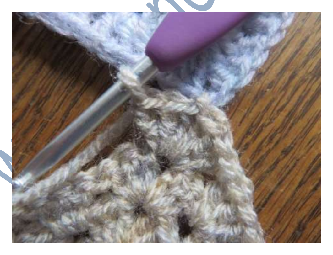
Make 3 tr (see photo above). Corner is finished. In every other opening of the first gs you make a sl st and 3 tr in the current gs.

Insert hook in the corner of the previous gs, pull up yarn and pull through loop. What you do is making a sl st. This slip stitch is instead of the ch 1 that comes in a corner.