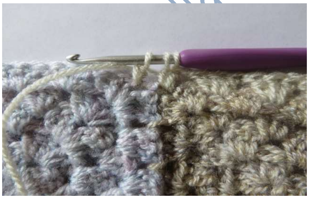
Insert hook in corner of the next gs and pull yarn through two loops of the hook. Pull yarn through remaining three loops.