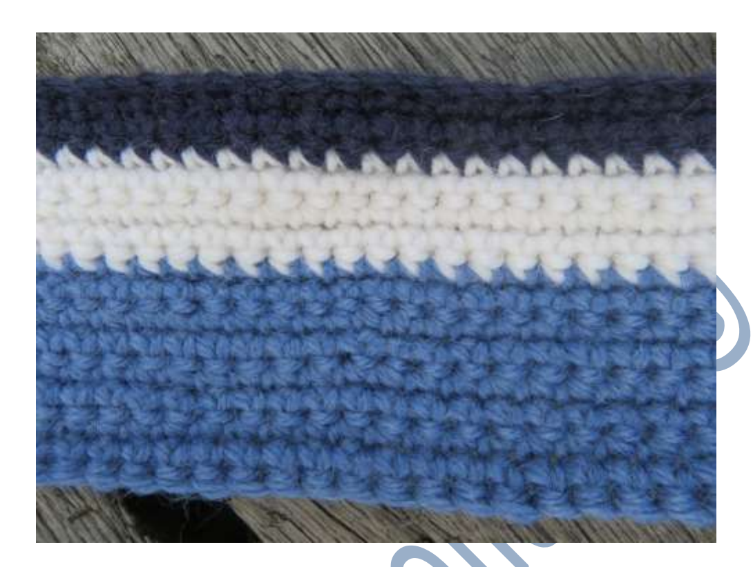
Part 4: The strap

I have made the strap with the yarn I had left. My strap is 88 cm long and 6 cm wide. Just measure how long you want your strap to be. So start with a chain and in the second stitch of the chain 1 dc. In every next stitch 1 dc. At the end of every round ch1, in every stitch 1 dc. Fasten off and attach your strap on the inside of the bag.