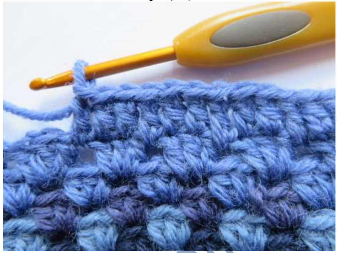
Granny stripes and one round trebles of the bag.

Make 5 rounds of granny stripes and fasten off.