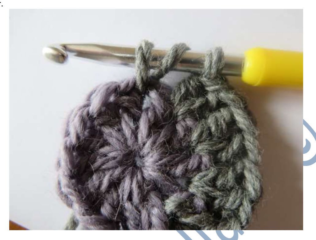
Round 2: New colour.

Ch 3 and 1 tr in the same stitch, ch 1. Now you are going to make clusters.