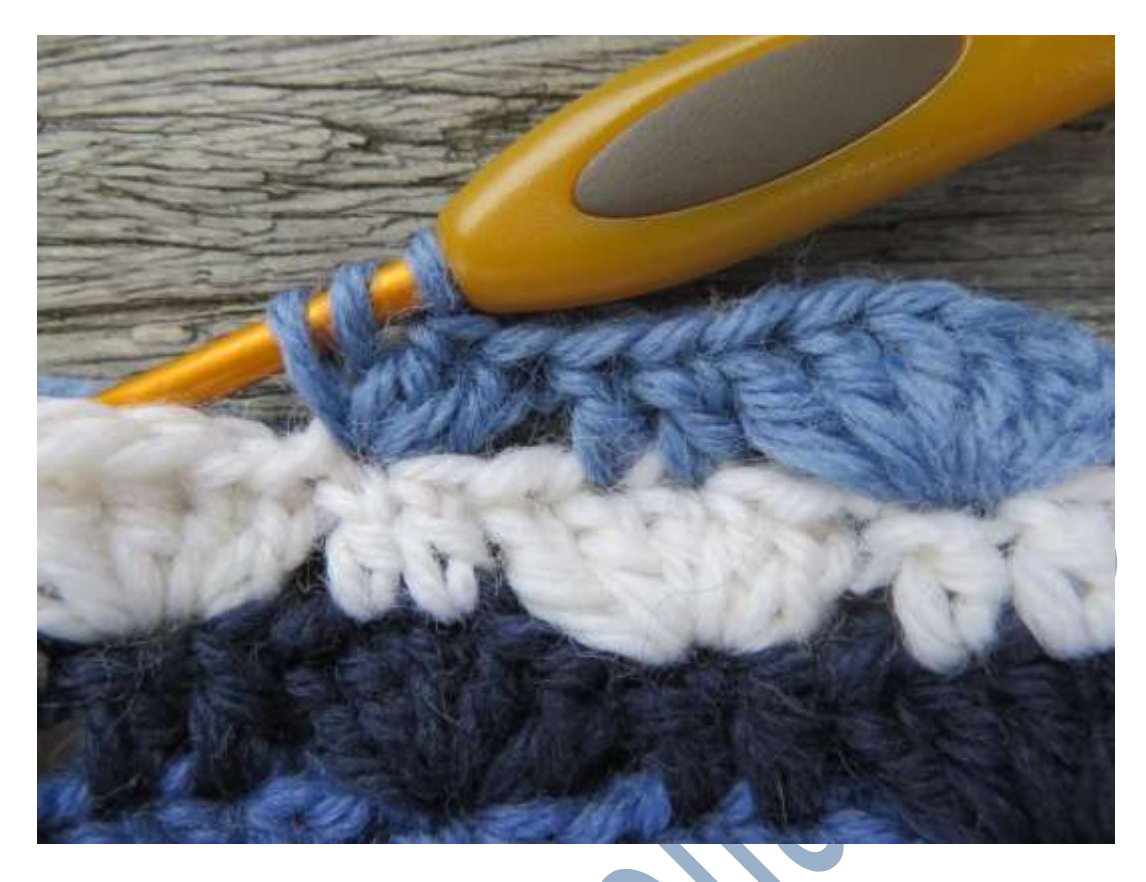
The 2 tr in the following rounds goes above the 5 tr of the previous round, in the third and fourth stitch. The shell of 5 tr comes now in between the 2 tr of the previous round.