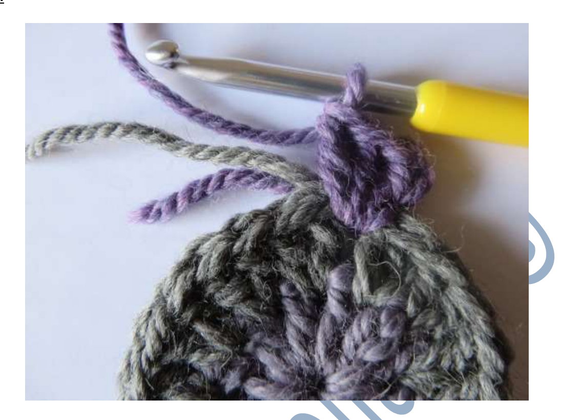
Start new colour in any space and ch 3, 2 tr, ch 1. In every next space 3 tr, ch 1.