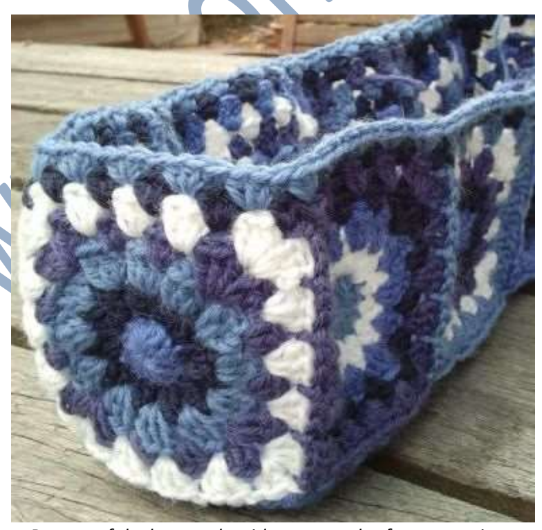
Bottom of the bag ready with two rounds of granny stripes.

The four gs for the bottom have one colour (1 x Navy, 1 x Blueberry, 1 x Bluebell, 1 x Denim). Do not fasten off after every ro but go with a sl st to the ch sp.