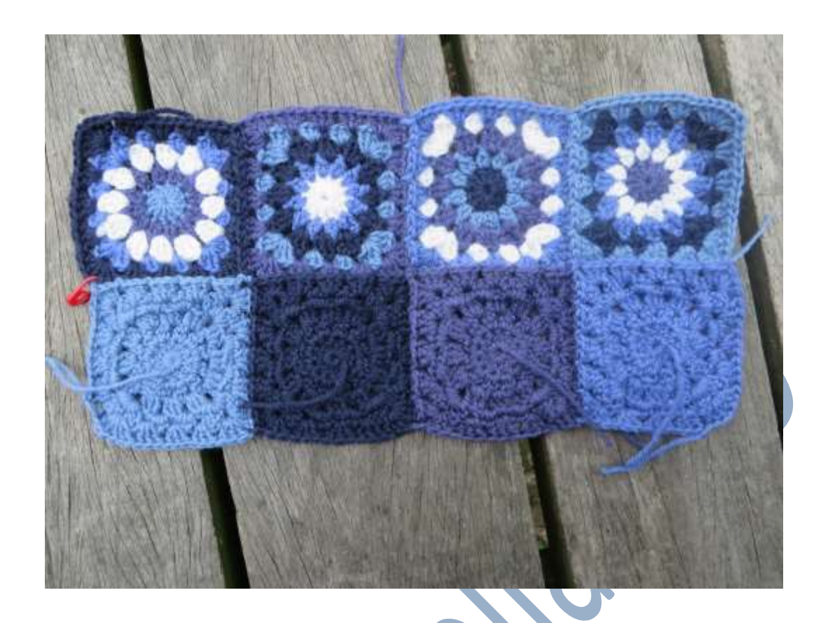
!!: On the next photos I use another colour of yarn.