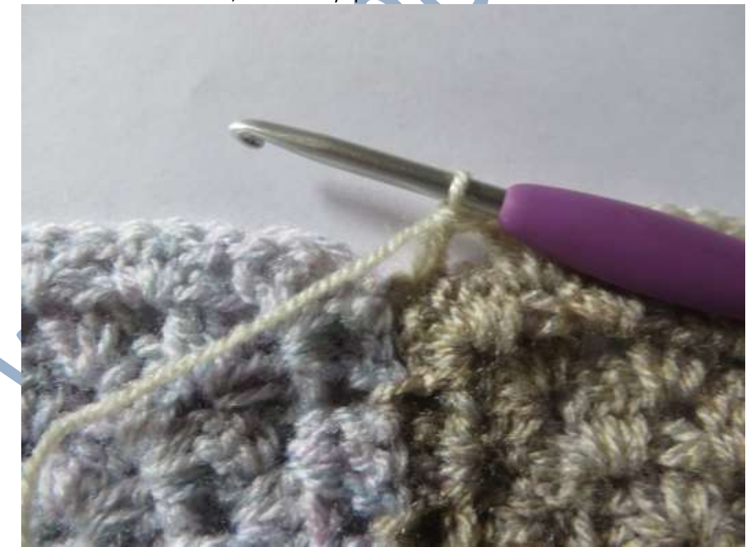
You now have reached two joined gs. Make 1 tr in the corner (see photo above).

Start in a corner and make a corner, and in every space 3 tr.