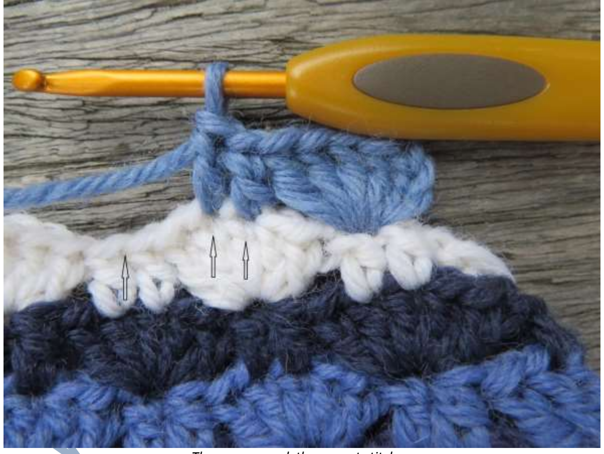
The arrows mark the correct stitches.

De door u gehaakte deken mag worden verkocht, zij het met vermelding van herkomst van het patroon: www.cronelia.nl