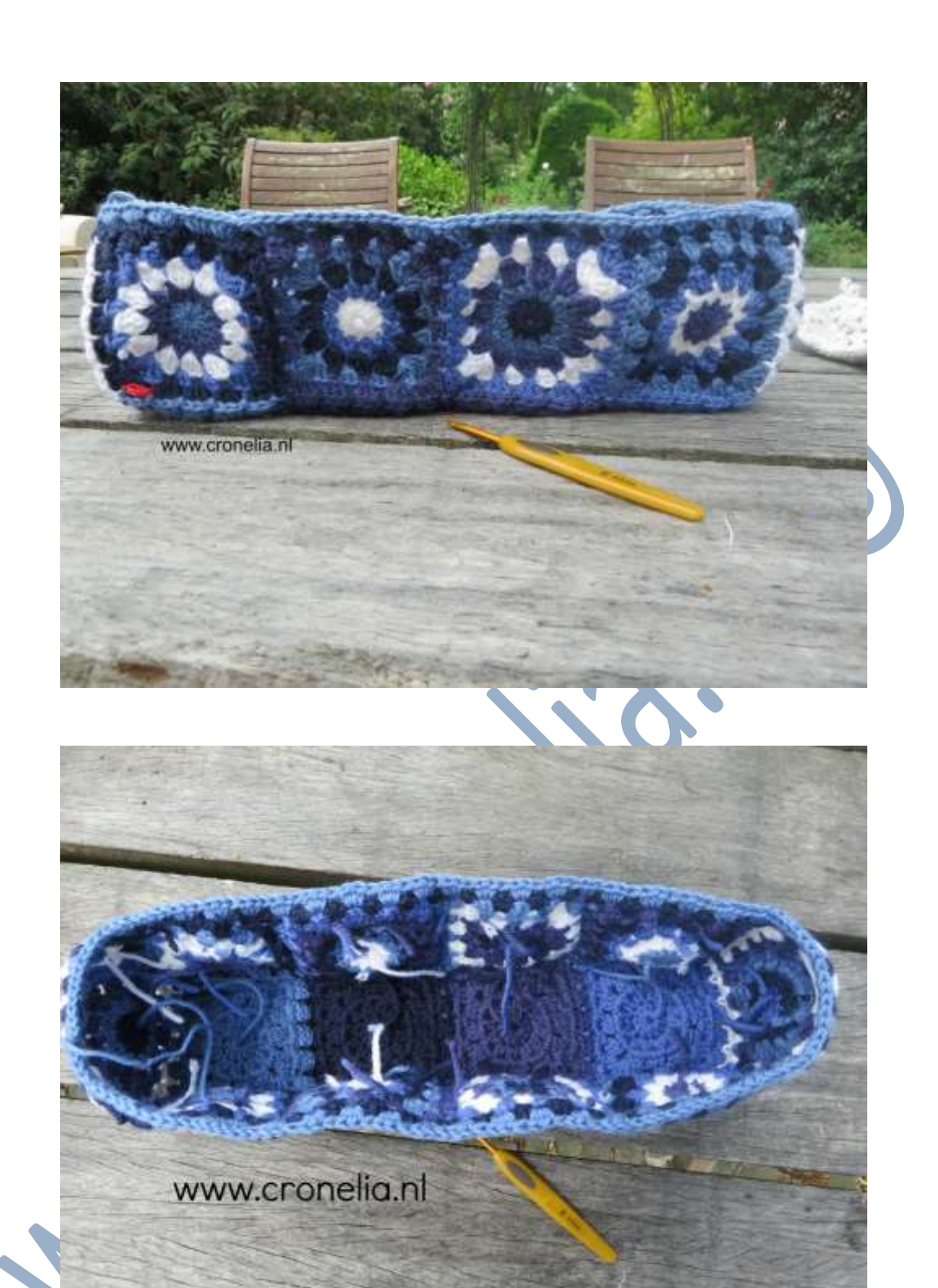
Bottom from the inside.