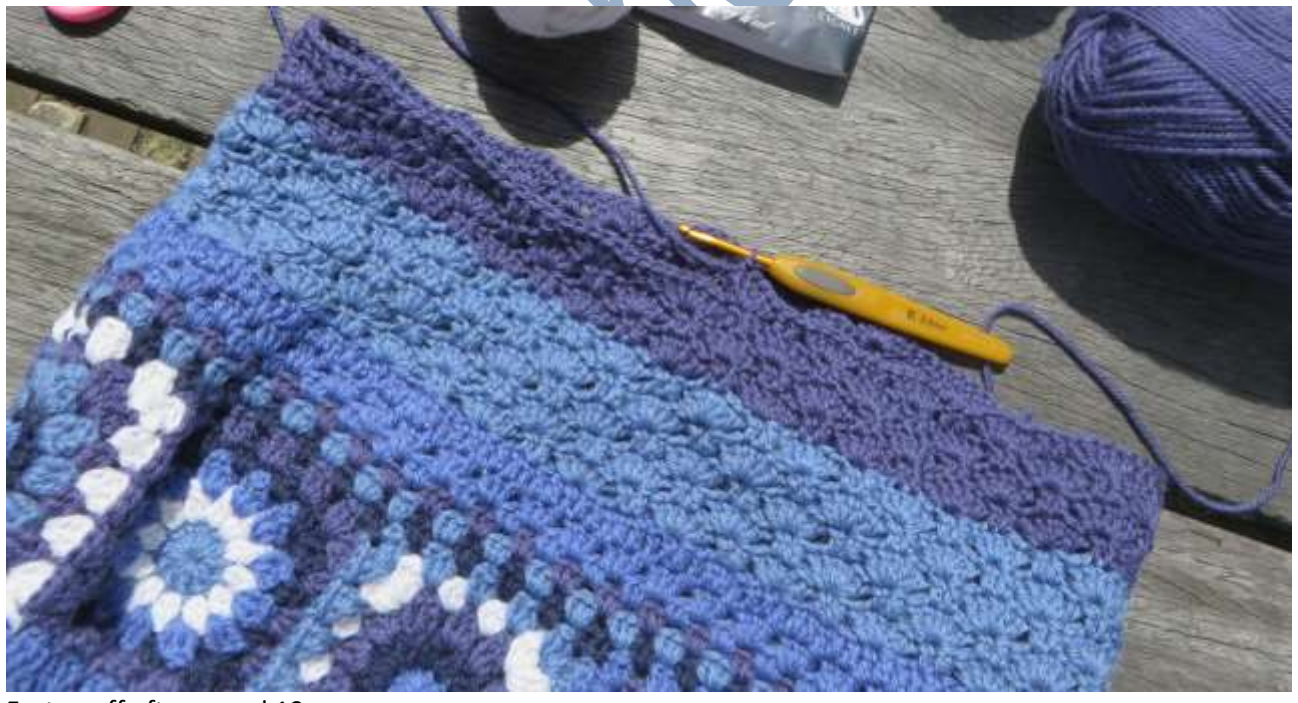
Fasten off after round 19.