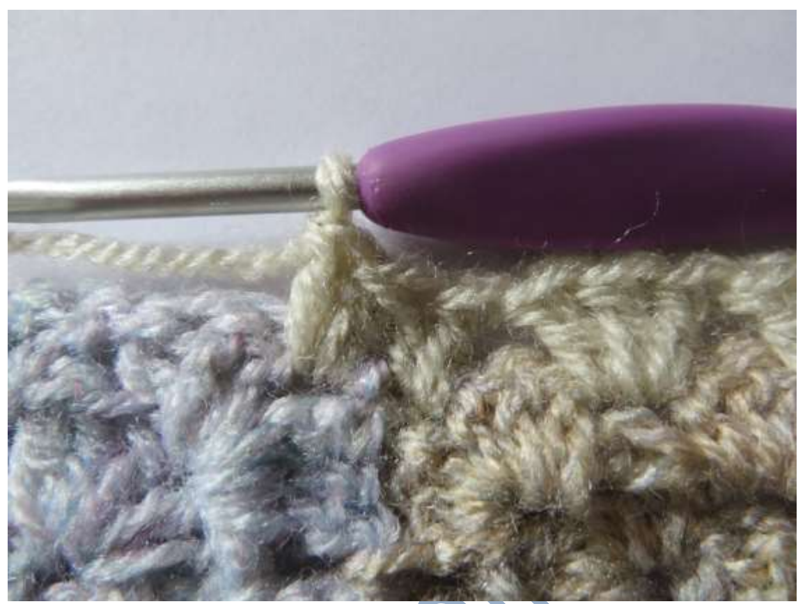
Make 1 tr. You now see two groups of two 'trebles'. In next spaces 3 tr, until next two gs. Repeat all the way round.

The next round: Consider these two groups of two 'trebles' as one group of 3 tr. Make in every space 3 tr (see photo below).