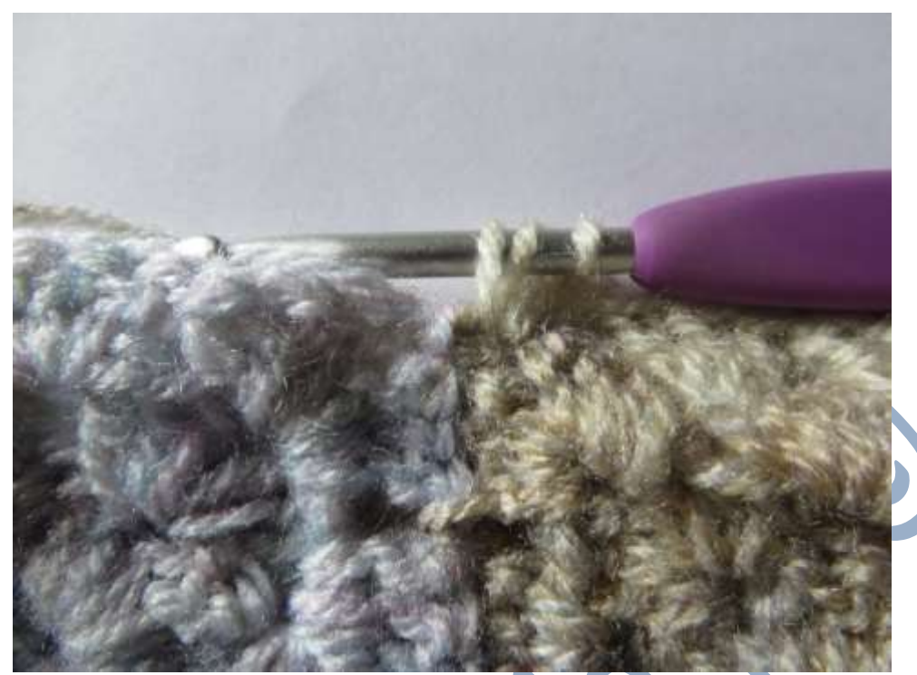
Start a new treble but do not finish it. Three loops on hook.