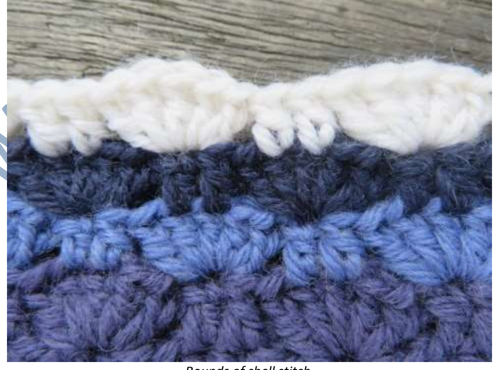
Rounds of shell stitch.