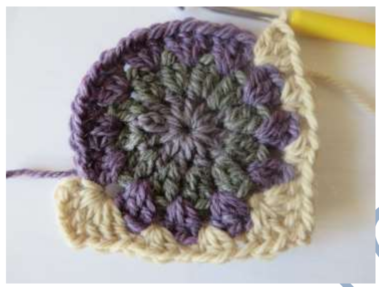
Round 4 with htr on the sides.