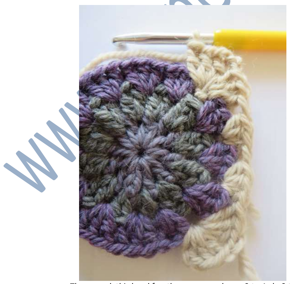
The second, third and fourth corner are always 3 tr, 1 ch, 3 tr.

New colour. We now make the first corner. Corner 1: ch 3, 2 tr, ch 1, 3 tr. In the next two spaces 3 htr.